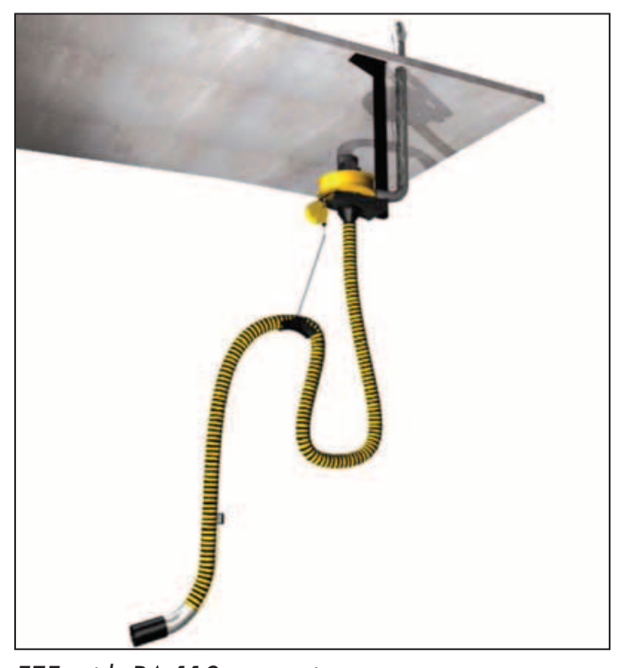
FEF with PA-110 extension mount.